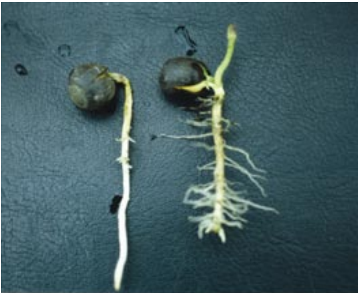
Figure 1. Young tissues are much more responsive to air-root-pruning compared to older tissues. These two oak seeds are the same age since germination. The one on the left continues downward extension of the taproot. The one on the right was air-root-pruned 4 inches below the seed, has already produced many secondary branch roots, plus the top has begun to develop.

Root tips exert an apical dominance just like twigs. With roots, the white tip is most responsive and when air-root-pruning occurs at the proper location, secondary roots typically begin to form quickly and within 3 to 5 days the 4-inch rule is obvious. By contrast, in nature the tip of a taproot extends downward until conditions become unfavorable (rock, hard subsoil, lack of oxygen, water table, etc.). Only when the tip of the taproot stops growing or dies does secondary branching occur, but by then the tissues just beneath the soil have matured and few branch roots are produced on most species. As a result, only a fraction of the secondary roots form in nature compared to when the tip of the young taproot is air-pruned in a container at a point about four inches below the seed (Figure 1). Horizontal roots respond to the 4-inch rule as well. However, the 4-inch rule does not apply to roots that extend out to the sidewall of smooth conventional containers and circle. The exception is when sun hits the sidewall and kills the roots, which results in heat-pruning. Then the 4-inch rule does apply from the point of root death back around the container.