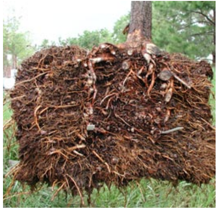
Figure 4. The root ball on this 3.5 inch stem diameter lacebark elm was cut in half using a chain saw. The tree was propagated in an original RootMaker® 4-pack propagation container to stimulate root branching, then grown in a RootMaker® 3-gallon (10.5 inch top diameter) for one year, (Note root mass marked by two white labels showing bottom of 3-gallon root system), then grown in a 15 gallon RootBuilder® container (18 inch top diameter) for 1.5 years. Note the complementary effect of each container size with the next to create an extremely fibrous root system.

By utilizing the 4-inch rule, and root-pruning containers, root branching is maximized throughout the growth medium, roots have maximum access to nutrients and water, which in turn stimulates top growth and improves plant quality. Combine the 4-inch rule with alert and timely transplanting from one root-pruning container to another and plant growth and quality of both tops and roots takes a giant step forward. Figure 4).