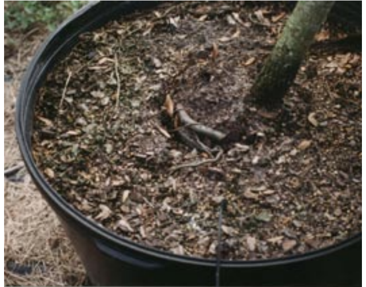
Figure 2. Circling roots and root-bound conditions can prevent proper anchoring and establishment in a larger container. It can also occur when the distance from the side of the smaller container to the side of the larger container exceeds about four inches.

Have you ever noticed that when a plant is shifted from a small container to an overly large container that the root system is slow to develop to the point where the root ball is firm and you can no longer see the root system 'flex' when the wind blows? This can result from circling roots and root-bound conditions in conventional containers (Figure 2). It can also result because up-sizing exceeded the 4-inch rule, and substantial 'extra' time in production is required. The plant may have grown to market size, yet a sale was missed was because of the 'flex' in the root system.