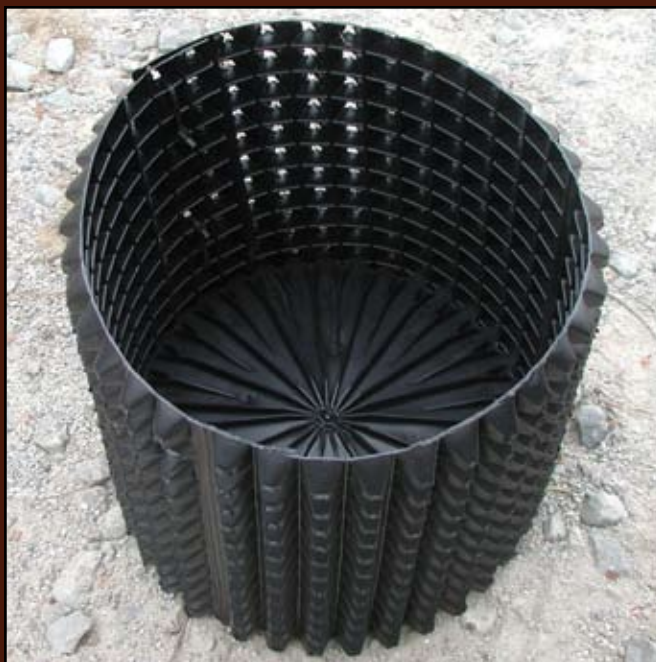
RootBuilder ® High 5®

The RootBuilder ® II is a highly successful, patented container that continues air-root pruning. A hole is at the tip of each outwardly projecting funnel on the sidewall of this container. Roots are directed outward to these holes and forced to branch again by air-root pruning. Because of the configuration, the sidewall is shaded, reducing temperature and evaporation.