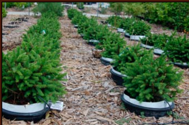
Grown in RootTrapper® Pot-in-Pot Insert.

RootTrappers® that are custom made to fit any size socket pot to solve the problems of pot-in-pot production. Plants do not blow over and roots are kept cooler in summer and warmer in winter. By using the RootTrapper® insert, root escape is almost non-existent and a fibrous root system is created. Containers can be completely sewn together or overlapped for easy removal.