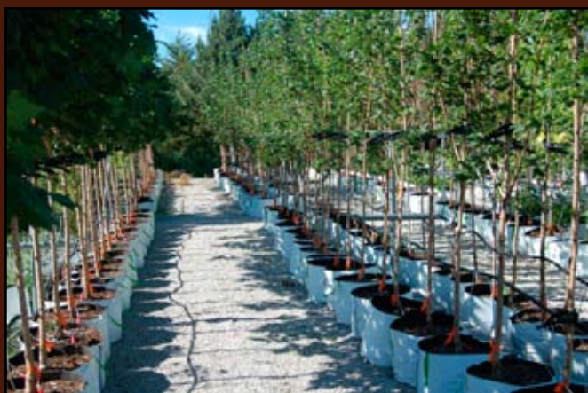
Trees in production in RootTrappers.®

The RootTrapper® container is a black, spun-bonded fabric, laminated with a white outer coating. The inner fabric stops circling roots and continues to stimulate root branching by trapping root tips. The white outer coating greatly reduces container temperature so roots do not die on the sunny side as with black plastic containers. Water seeps out the hundreds of holes created by the unique manufacturing of RootTrapper® material, reducing water usage and costs.