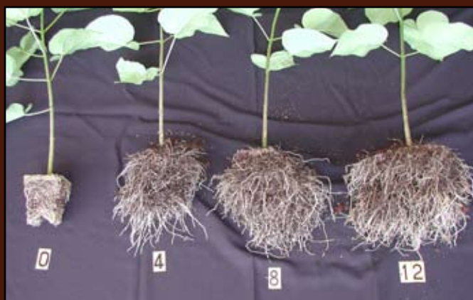
0, 4, 8, and 12 days Catalpa transplanted from RootMaker® 18 cell.

Timing is very important. Once a fibrous root system has been created, it is time to shift to a larger container. If plants are left in RootMakers® too long, the benefits will begin to decrease and water management may become more difficult due to the unique, high concentration of roots. Monitor your plants' progress. Seize every opportunity to continue root branching momentum.