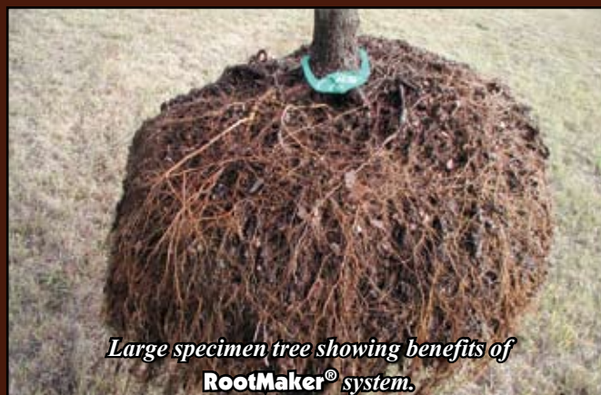
Large specimen tree showing benefits of RootMaker® system.