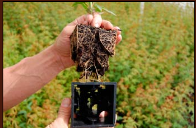
Root system created by RootMaker® Express propagation container.