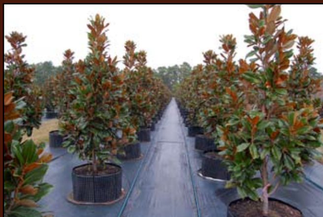
Magnolias in RootBuilders ®.

The RootBuilder ® II expandable container comes in a 100 foot continuous roll and can be cut to create any size container. With a few inches of overlap, the container is assembled using cable ties. For best results, use our RootTrapper ® Disk as the bottom of the container.