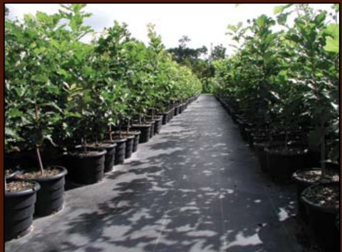
RootMaker ® 3 gallon oaks in nursery production.

Transplanting seedlings with excellent root systems into conventional smooth walled plastic pots is a gross error. Roots grow outward, contact the sidewall and circle. Active root tips decline and anchorage of the plant is poor (above, left). By contrast, when a rooted cutting or seedling from a RootMaker ® propagation container is transplanted into a three gallon RootMaker ® container, the result is a continued fibrous root system with no circling and large quantities of root tips are poised to extend and establish the plant in the field or landscape (above, right).