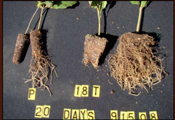
Left, oak in standard plug. Right, oak in RootMaker® 18 cell. 20 days after germination.

For best results, we recommend using RootMaker® propagation trays on top of a wire bench or other support that allows airflow, 18 to 24" above the floor to allow good air circulation and thus efficient air-root pruning on all sides of the container, not just the bottom.