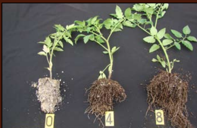
0, 4, and 8 day tomatoes transplanted from RootMaker® 32 cell.

RootMaker® products are considered the premier fibrous root production tool by leading nurseries around the world. RootMaker® containers have been designed to provide maximum air-root pruning. The benefits of a fibrous root system is proving to be tremendous for ANY plant from vegetables to trees, whether organically grown or with standard commercial practices. When the root tip surface area is increased, there is a corresponding increase in the efficiency of the plant.