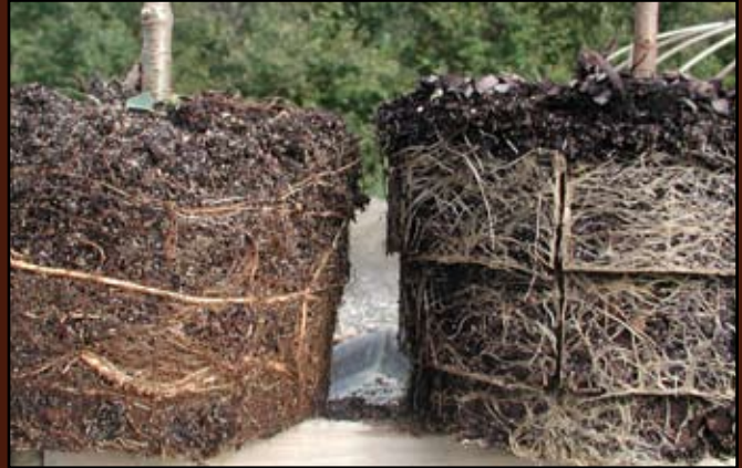
Left, standard production with circling roots. Right, fibrous root system created by RootMaker ® 3 gallon.

Transplanting seedlings with excellent root systems into conventional smooth walled plastic pots is a gross error. Roots grow outward, contact the sidewall and circle. Active root tips decline and anchorage of the plant is poor (above, left). By contrast, when a rooted cutting or seedling from a RootMaker ® propagation container is transplanted into a three gallon RootMaker ® container, the result is a continued fibrous root system with no circling and large quantities of root tips are poised to extend and establish the plant in the field or landscape (above, right).