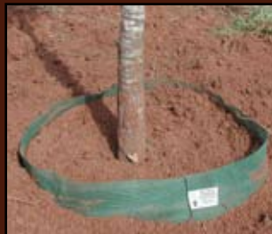
Installation of Knit Fabric container (left) and finished planting (right).