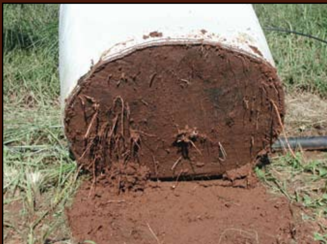
RootTrapper® Grounder harvested to show tacking roots.

The RootTrapper® Grounder not only prunes by trapping root tips with the RootTrapper® sidewall, it has the additional benefits of pruning the bottom roots by constriction while allowing the roots to grow into the soil through the knit fabric bottom. This allows the plant to capture additional water and nutrients.