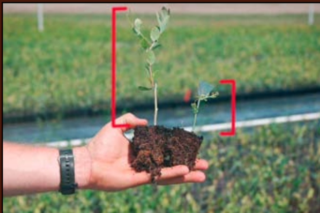
Same age blueberries grown in 32-Cell RootMakers® (left) and standard pot (right). Notice the massive size difference.

The length of time in RootMaker® propagation containers varies, depending on the plant, but it is typically between 2 to 4 months.