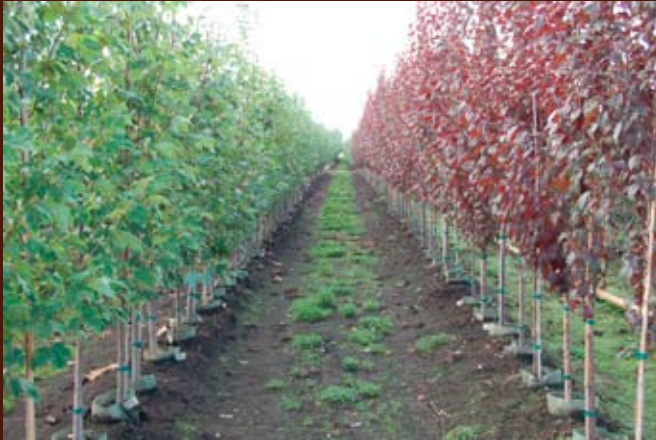
Trees in production in Knit Fabric containers.

The knit fabric container offers the ability of growing in the field with the ease of harvest and mobility of containers. With openings 5/64th inch in diameter, root pruning is predictable and precise. Root constriction occurs at the proper root diameter in order to stimulate secondary root-branching. As a root increases in size, both inside and outside the fabric wall, a callus bridge will form at the adjacent opening in the fabric. When the plant is harvested, the roots break off at the face of the fabric. This callus bridge prevents stunting of tree growth.