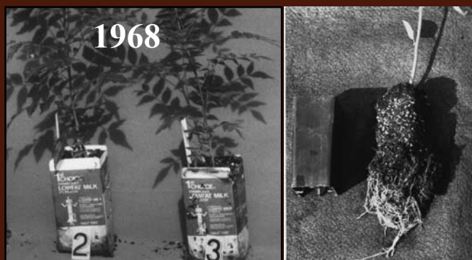
Milk cartons (left) and tree bands (right) only prune roots at the bottom, creating few side branches.