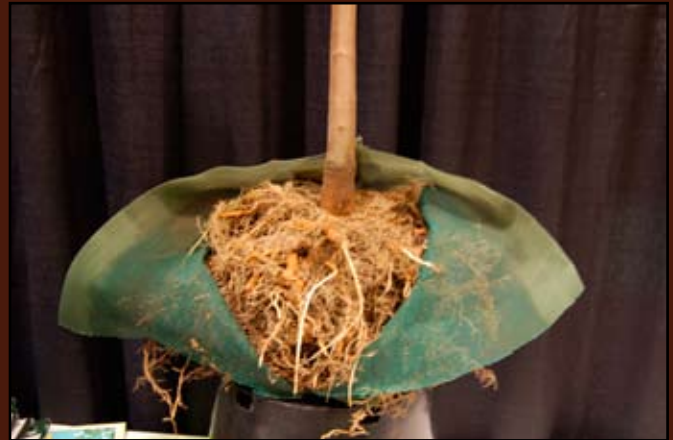
Fibrous root system created in Knit Fabric containers.

Water management is less complicated in the field and the root system is protected from temperature extremes. Remove the fabric once a tree has been harvested. Once planted, the tree will benefit from having a great majority of the root system intact, well branched, and equipped to establish into the surrounding soil.