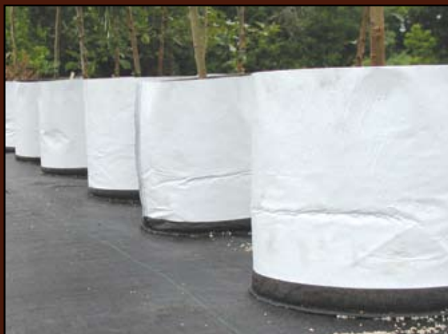
Crape Myrtle in production in RootTrapper® II.

The RootTrapper® II does not have the bottom two inches of the sidewall laminated. This improves drainage and aeration where the soil column needs it most, while not exposing the entire sidewall to excessive evaporation and water loss. The RootTrapper® and RootTrapper® II are available in sizes from 5" diameter to 500 gallon.