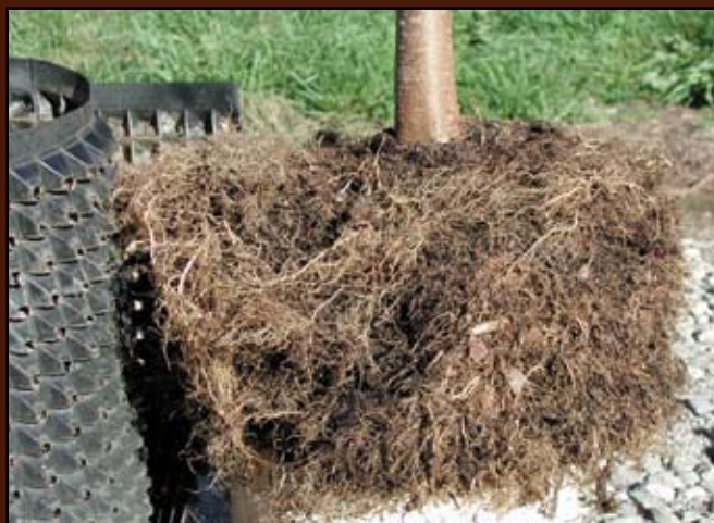
Dense fibrous root system from High 5 ®.

The RootBuilder ® II is a highly successful, patented container that continues air-root pruning. A hole is at the tip of each outwardly projecting funnel on the sidewall of this container. Roots are directed outward to these holes and forced to branch again by air-root pruning. Because of the configuration, the sidewall is shaded, reducing temperature and evaporation.